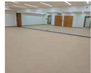
VIEW OF MULTIPURPOSE STUDIO AND MIRRORED FRONT WALL