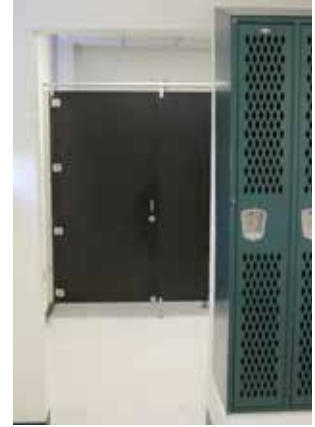
AFTER CONVERSION: view from lockers to changing areas