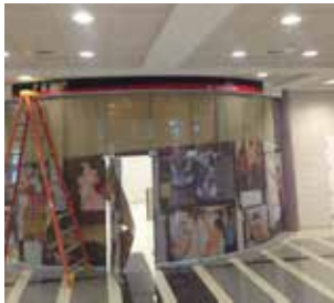
CONVERSION TO FUNTIONAL TRAINING STUDIO IN PROGRESS