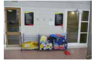
SAUNA ON LEFT; STEAM ROOM ON RIGHT