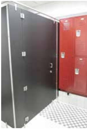
AFTER CONVERSION: view of changing space and new lockers