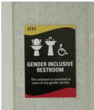
AFTER CONVERSION: new sign