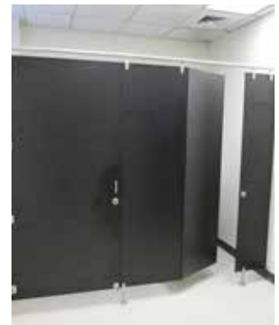
AFTER CONVERSION: view of changing areas