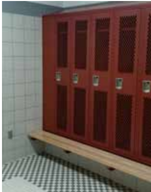
BEFORE CONVERSION: view of lockers