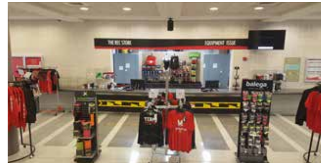
AFTER CONVERSION: with full product line