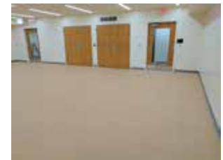
ENTRANCE AND STORAGE DOORS AT BACK OF MULTIPURPOSE STUDIO