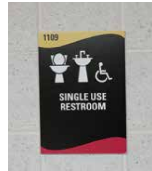
AFTER CONVERSION: new sign