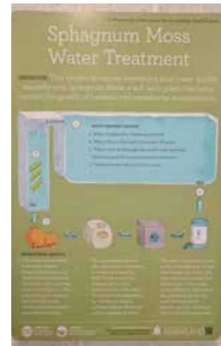
SUSTAINABILITY GRANT RECOGNITION SIGN DESCRIBING MOSS WATER TREATMENT PROCESS

RecWell has been in partnership with University Facilities Maintenance and the Aerospace Engineering Department to research and plan future Sphagnum Moss projects on campus