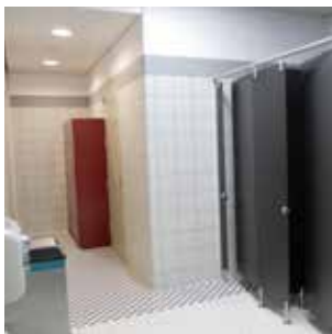
AFTER CONVERSION: view of new lockers by bathroom door and new partitions