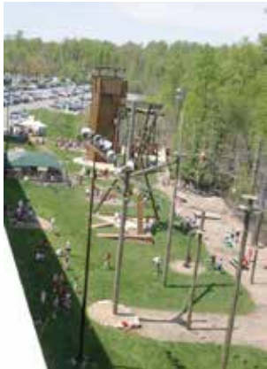
FACILITY WITH HIGH ROPES AND RELOCATED FENCE THAT EXPANDED PROGRAM AREA