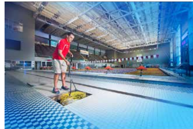
SPHAGNUM MOSS BEING LOWERED INTO THE 50M SURGE BALANCE TANK