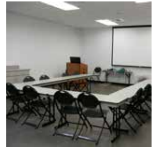
AFTER CONVERSION: Classroom setup