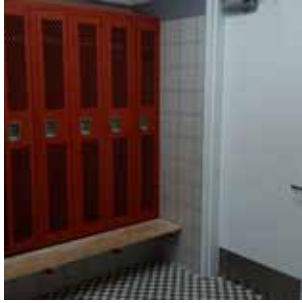
BEFORE CONVERSION: view of lockers and bathroom entrance