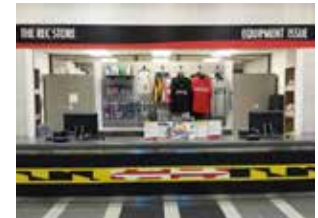
AFTER CONVERSION: with basic product line