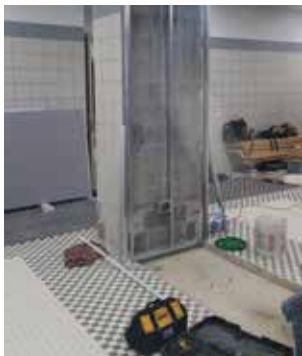
CONVERSION IN PROGRESS: prep for dry wall to wrap column