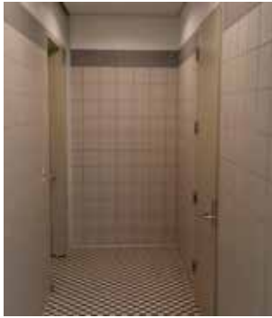
BEFORE CONVERSION: view of door leading to bathroom