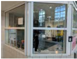
VIEW OF OFFICE FROM POOL DECK