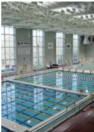
AFTER CONVERSION: LED at 50% lumin output