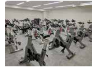
VIEW OF CYCLING STUDIO FROM BACK OF ROOM