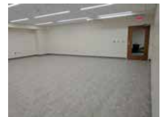
ENTRANCE DOOR TO CYCLING STUDIO