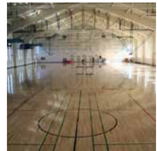
BEFORE LIGHTING AND PAINTING IMPROVEMENTS