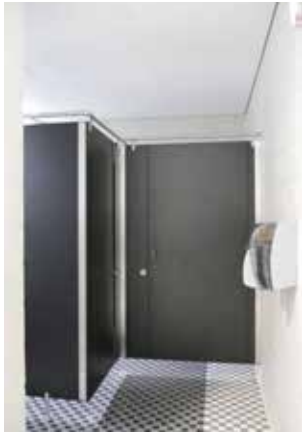
AFTER CONVERSION: new partitions